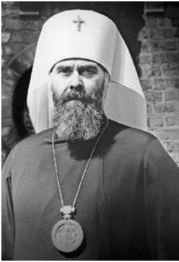
Metropolitan Anthony of Sourouz

remember the words which were spoken to the Mother of God when she brought her Child, Jesus, to the Temple: that a sword will pierce her heart. This sword was the death of Christ upon the Cross. In the Annunciation we see both the promise of salvation given to the whole of mankind, (indeed, the promise that one day God will be all in all, and that the whole Creation will become the shining, glorious vesture of God) and the Cross.