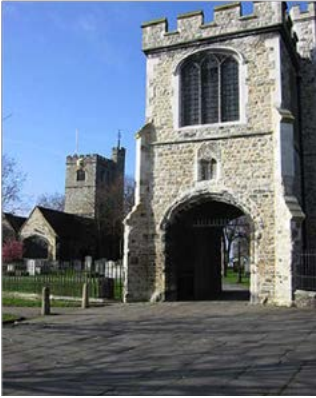
St Margaret's Church

the great convent in Wimborne in Dorset. In the 10th century, at the time of the monastic revival in England, Barking had another saintly abbess named Wulfhild (+ 1000).