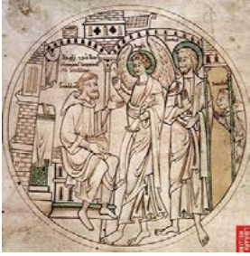
The Life of Guthlac drawing, kept at The British Library

Britain does not have natural deserts, so Guthlac preferred to live as a hermit, surrounded by dangerous and impassable bogs from all sides.