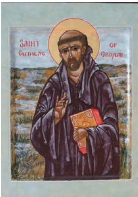
St. Guthlac of Crowland

At last the tempters left that site forever and the place became holy. As a reward for his fearless labours, Guthlac was granted great wisdom, the spirit of prophecy, clairvoyance, and the ability to heal diseases and to expel demons from possessed people. He was a close friend of wild animals - beasts, birds and fishes - he fed and protected them and nature served him as its master.